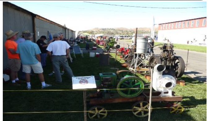
Flabob Show by Bob Smith

It is wonderful that we finish out the show season with a bang, yes Leroy's cannon! The folks at Flabob asked WAPA to participate in their salute to US veterans with our engines and tractors. The show area for the past two years has been upgraded with new grass and metal native plants, a far cry better than the dusty dirt we used to display on. We thank Flabob and tried to respect the new grass by not releasing hot water on it after the show. We had an excellent showing with 27 engines and 7 tractors. We filled the show area with engines while the tractors were displayed out by the taxiway. There was the traditional tractor parade and Leroy got to exercise his cannon several times throughout the show. All in all, it was a great day for the final show of the season. Thank you everyone!