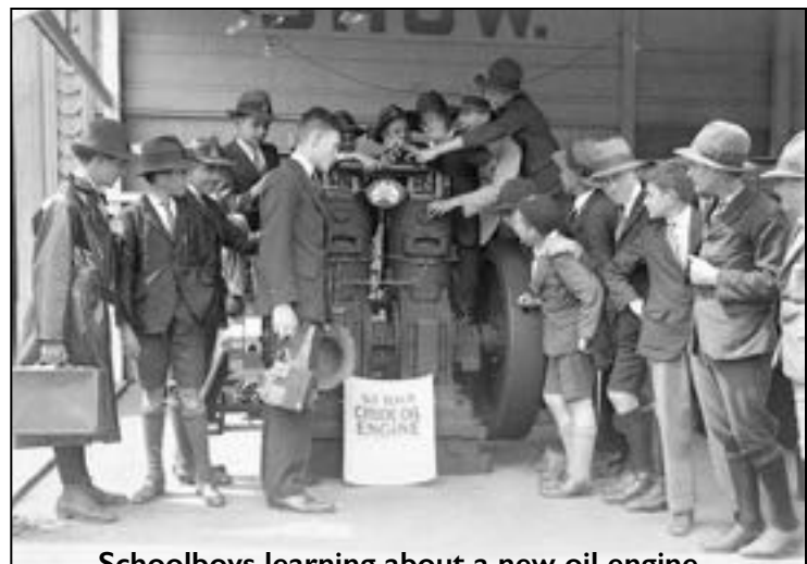
Schoolboys learning about a new oil engine