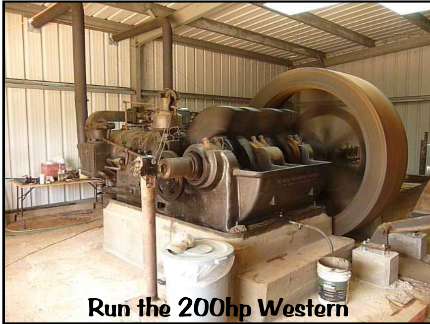
Run the 200hp Western

At the California Citrus State Historic Park