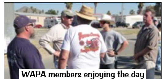
WAPA members enjoying the day