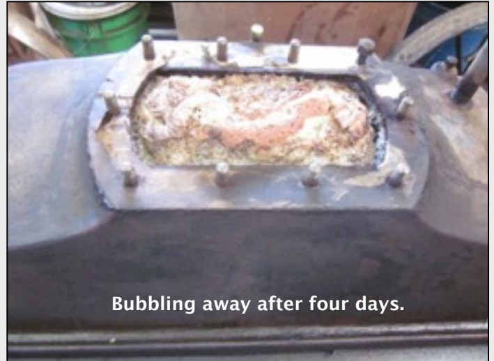
Bubbling away after four days.

After six days. As you can see from the pictures the bottom and sides were clean and rust free, but right near the top a little rust sheen was left. Maybe that would have been removed had I left it a few more days. The brass inlet screen was totally crusted up, and now is excellent after draining it all out, washing it out repeatedly, then soaking it in a solution of baking soda and water to stop the acid action. Then I rinsed that out, dried it and fogged it with WD-40. So, if you don't want to grind and sand and you don't want to sandblast, this process works really well.