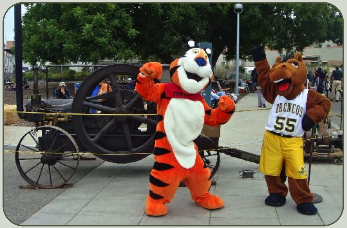
Fun and Games at Cal Poly

Journal of the Western Antique Power Associates