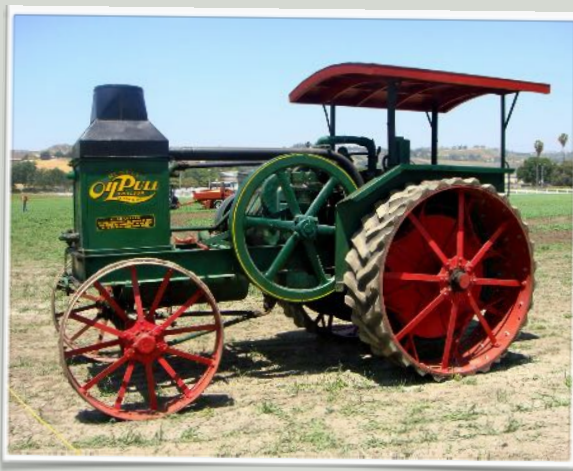
Dutch Bankston's Rumely Model G