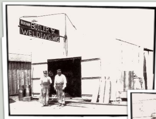
Roxana Boiler & Welding Works