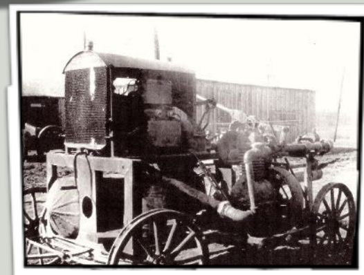
Automatic tube descaler invented by Ross Meskiman