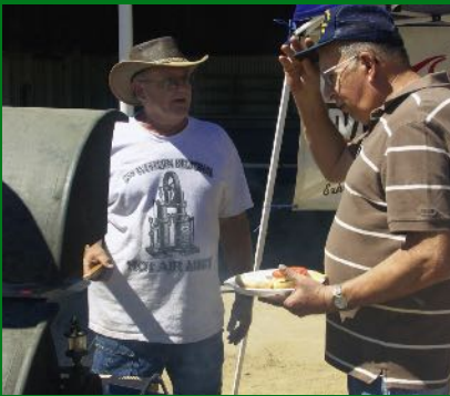
Please, sir, I want some more. - O. Twist