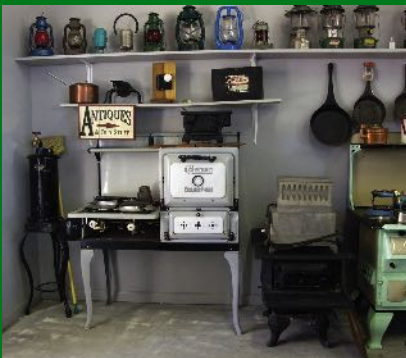
A rare water heater and Coleman stove seen in one of the museum buildings.